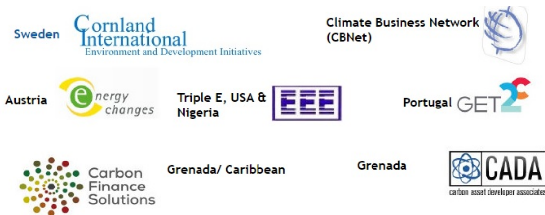
Figure 1: Our international partners

Carbonergy is a Philippines-based company that works closely with an international group of highly-qualified experts in the energy, environment, mitigation of carbon emissions, and carbon market areas. Collectively, we have developed, managed & implemented numerous programmes and projects worldwide on behalf of donor and UN agencies supporting: the Kyoto Protocol (Clean Development Mechanism (CDM)); Nationally Appropriate Mitigation Actions (NAMAs); Paris Agreement (Nationally Determined Contributions (NDCs) and Monitoring Reporting and Verification (MRV) systems); and the voluntary carbon markets. We have also provided technical support to the UNFCCC and the Intergovernmental Panel on Climate Change (IPCC).